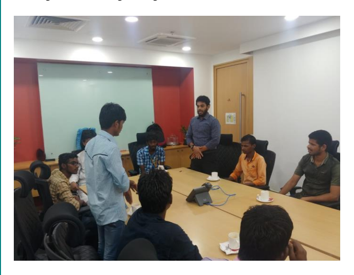
During a company visit as part of EMET, Company HR addressing the students