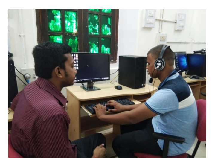
Using headphones to comprehend screen reader