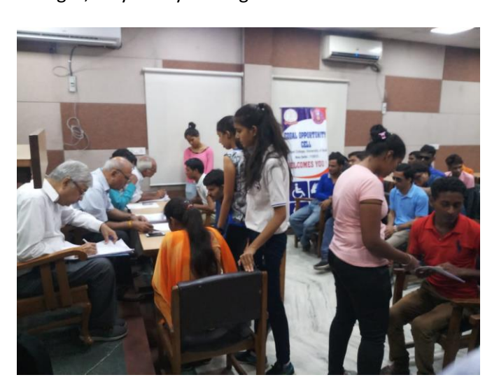
At Rajdhani College, New Delhi

We live for these moments — when the entire HTBF swings into action to disburse donor funds to deserving visually impaired students across the country. Here's a quick snapshot of our scholarship application and disbursement activities across some of our partner colleges, ably led by our regional coordinators.