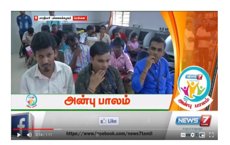
News 7 Channel, Chennai, covered our scholarship distribution process, "The Bridge of Compassion", and gave in-depth coverage of our activities.