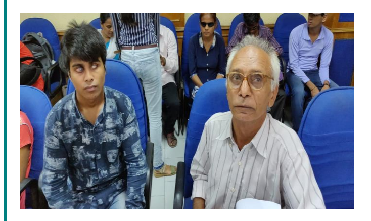
At Satyavati College