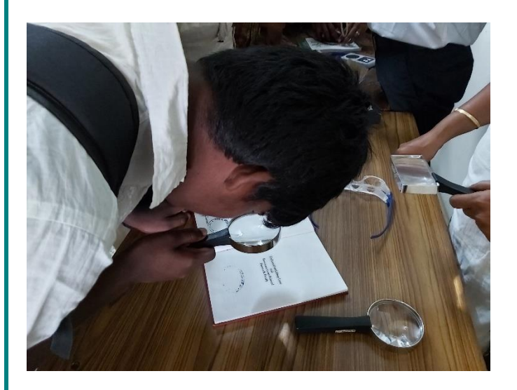
Reading without Seeing – using assistive devices