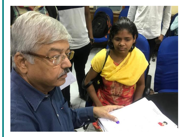
At Satyavati College,New Delhi.