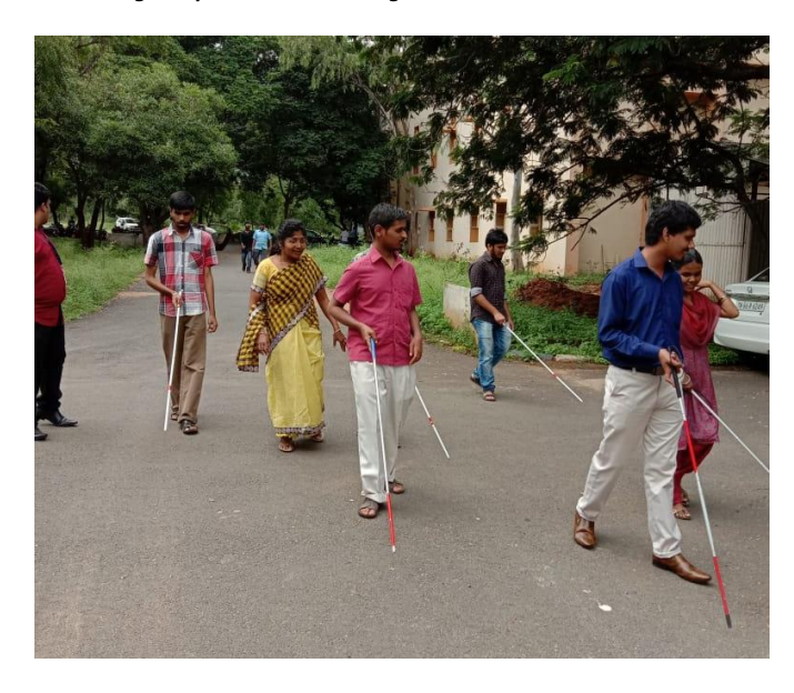
Mobility training as part of EMET