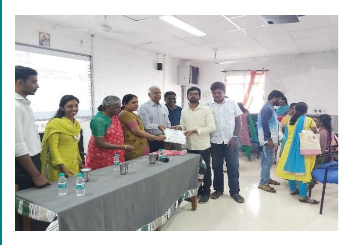
Certificate distribution after the programme. Seen in the picture are family members of our donor, Majestic Exports.