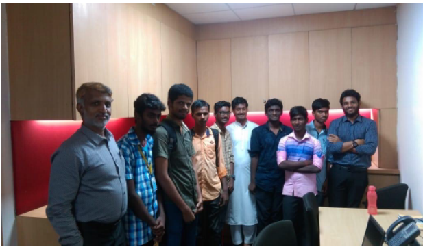
Company visit - Presidency college, Chennai

Presidency College is an arts, law and science college in the city of Chennai in Tamil Nadu, India, and is among the oldest government arts colleges in India. Queen Mary's College is a government-run college in Chennai, India. It is the first women's college in the city and the third oldest women's college in India.