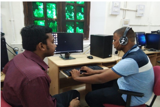
Computer Training at BHU

Banaras Hindu University (BHU) is an internationally reputed institution of learning situated in the holy city of Varanasi in India. Founded by the great nationalist leader, Pandit Madan Mohan Malviya, it is also the largest in terms of campus size as well as student strength. The university has produced many great freedom fighters and builders of modern India, and has contributed immensely to the progress of the nation through a large number of renowned scholars, artists, scientists and technologists who have graced its portals.