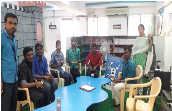
Signature training at DCL, Coimbatore

Bharathiar university aims to enable students to contribute more effectively towards establishing an equitable social, economic and secular ideal of our nation.