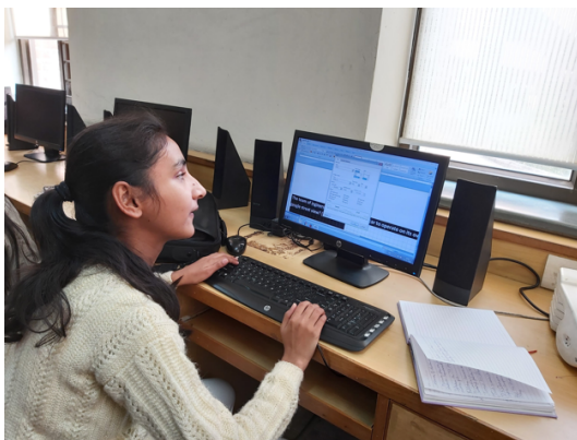
Candidate using MS Word during a Training session.

Daulat Ram College is one of the leading colleges in the University of Delhi. Miranda House has a special place among the women's colleges of the University of Delhi. The science departments at Miranda House are part of the Star Status awarded by the Department of Biotechnology, Ministry of Science and Technology, Government of India. Training in Satyawati College commenced in June'20.