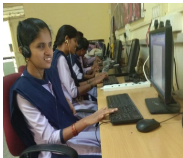
Keyboard orientation training

Today, one marvels at the sheer number of things that technology has made possible, starting from smartphones to the wonders of artificial intelligence! Technology and the expanding digital world have also come as a boon to the visually-impaired; it may come as a surprise to many that a visually-impaired person can be employed in over 180 job roles, all thanks to technology!