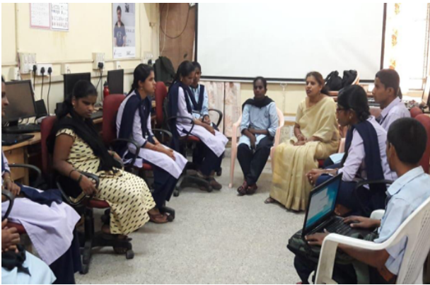
English training at Vijayanagar college

The college, situated in Vijayanagar, Bengaluru commenced operations in 1985-86, and has grown to provide quality education to over 2800 students in various streams. The college, affiliated to Bangalore University, is accredited with grade 'B' by NAAC with 2.72 CGPA. The institution is extremely proud of its well-equipped, perfect and unique enabling unit - 'Chetna'- the only one of its kind among government colleges in Karnataka. This unit plays the dual role of empowering visually and physically challenged students to face the challenges of the real world.