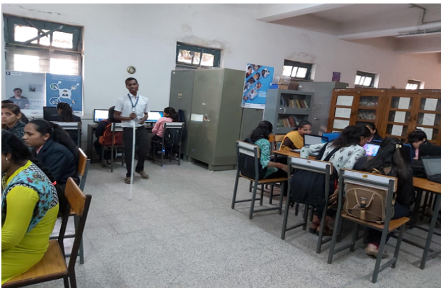
Mata Jijabai EMET Training Lab

Shri Atal Bihari Vajpayee Arts & Commerce College, accredited grade “A” by NAAC, aims to facilitate meaningful education to socially and economically backward classes by taking into account factors such as social needs, access, equity, and quality. The Mata Jijabai Girls College is a multi-faculty autonomous college for girls. The college plays a stellar role in imparting knowledge to women at a minimal cost.