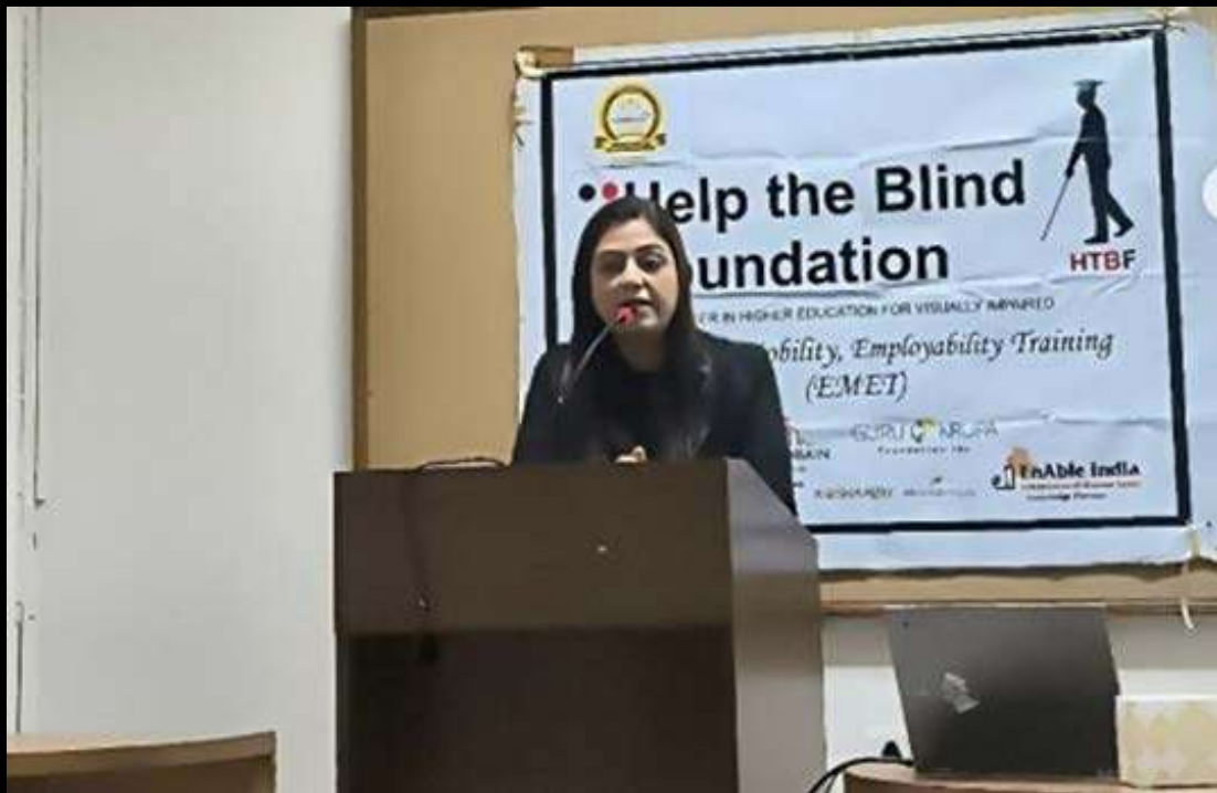
Skill-building workshop by Airbnb at Miranda House, Delhi.

From boardrooms to factory floors, from soft skills to job readiness this quarter, our students explored what careers look like beyond the classroom.