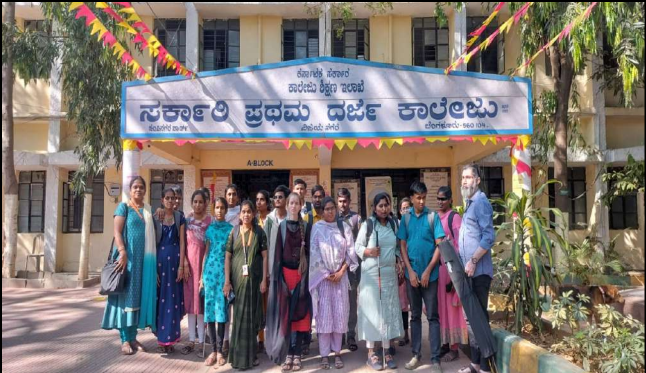
HTBF volunteers and participants during the Career Awareness Program held at Government First Grade College for the Visually Impaired, Bengaluru.

The session covered everything from using the STAR method in interviews to reframing feedback as a growth tool. Mock interviews gave students a chance to practise what they learned—and walk away with real-world tips from the pros.