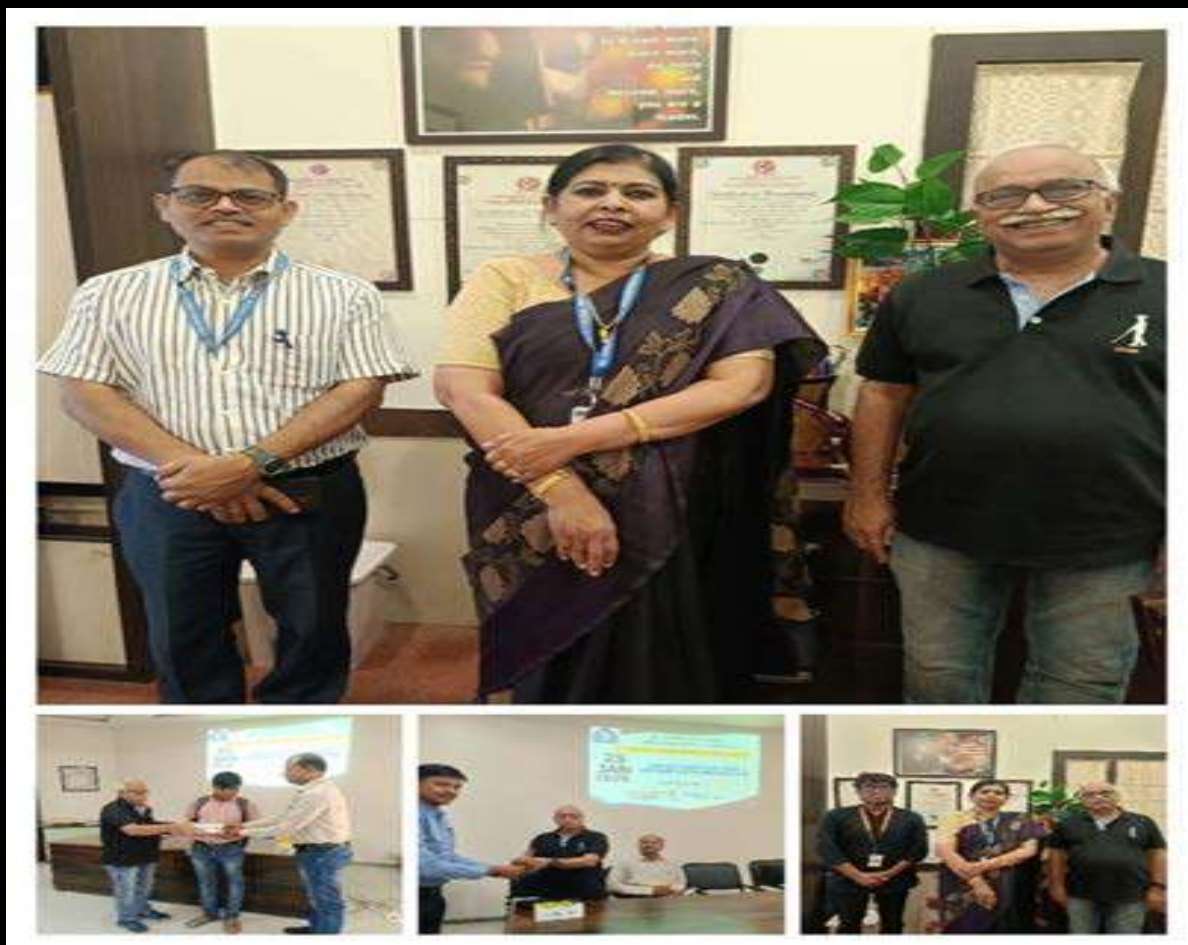
HTBF volunteers and team members at the Smart Vision Glasses distribution event in Nagpur.