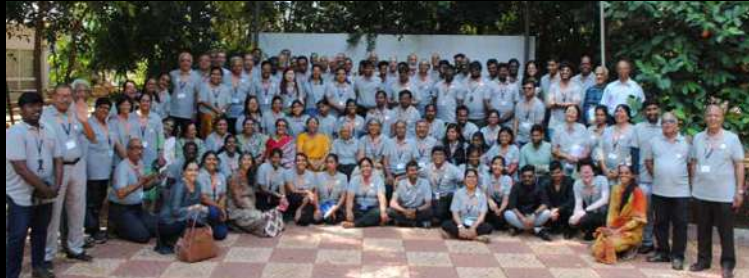
Participants at HTBF's Annual Meet 2025 at the School of Ancient Wisdom, Bengaluru.

From February 10 to 12, the School of Ancient Wisdom in Bangalore became a hub of meaningful conversations, shared purpose, and renewed vision. The Help the Blind Foundation's Annual Meet 2025 brought together 105 participants including 50 staff members, 60 volunteers, partners from NGOs, dignitaries, and collaborators all united by a common goal: to make quality education and skill development more accessible to visually impaired (VI) students across India.