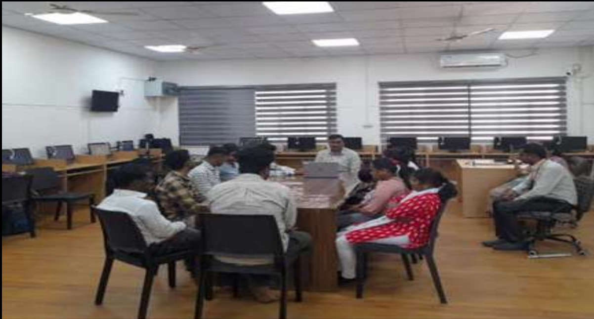
Nashik Resource Center

33 students received ₹3.3 lakhs in scholarships from HTBF. The event was led by college leadership and HTBF volunteers and marked another step in our journey toward educational equity.