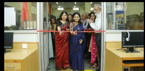
HTBF opens Resource Centers in Chennai, Nagpur, and Delhi